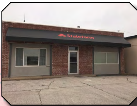
939 Avenue G Turn Key Office Space

Amazing home in a private, wooded 7.5 acre setting just minutes from Fort Madison. Approximately 6 acres are timber and ravine woods. Listing #20165295, $309,900.