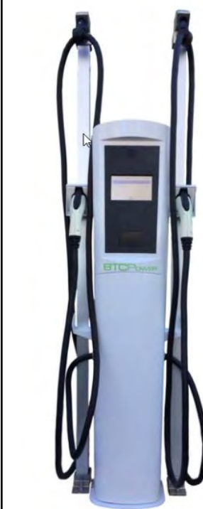
Level 2 charger