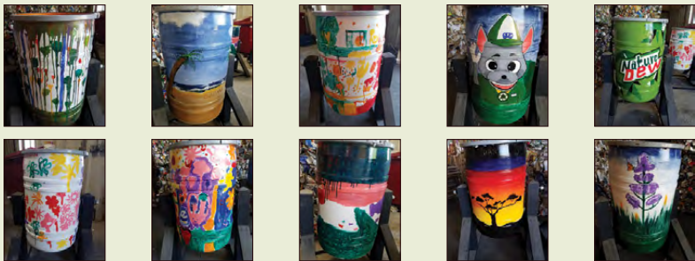
These backyard compost bins were made by students at the Keokuk Christian Academy & are now available for purchase.

Backyard composting improves soil quality & makes for healthier plants!