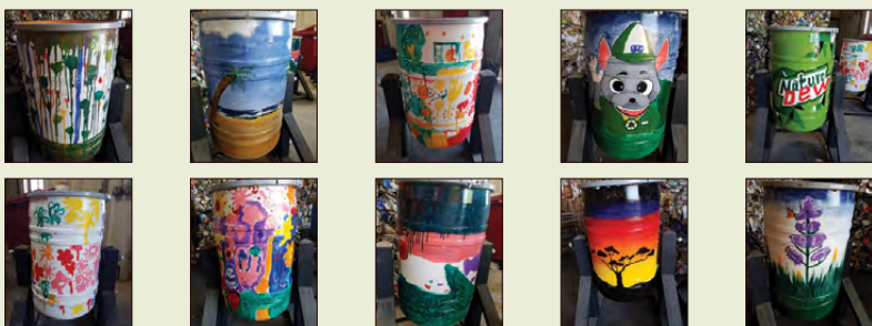
These backyard compost bins were made by students at the Keokuk Christian Academy & are now available for purchase.

Backyard composting improves soil quality & makes for healthier plants!