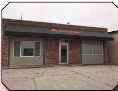
939 Avenue G Turn Key Office Space

Amazing home in a private, wooded 7.5 acre setting just minutes from Fort Madison. Approximately 6 acres are timber and ravine woods. Listing #20165295, $309,900.