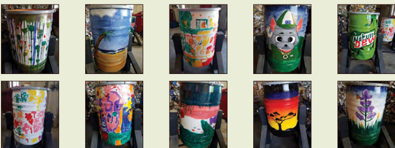
These backyard compost bins were made by students at the Keokuk Christian Academy & are now available for purchase.

Backyard composting improves soil quality & makes for healthier plants!