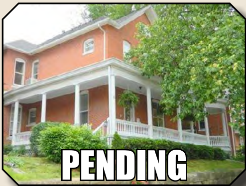
631 Avenue D 4BR • 2BA • 2 car garage

Beautiful victorian home on a quiet street with an amazing wrap-around porch. All the modern conveniences. Quite a charmer! Listing #20165372, $124,900.