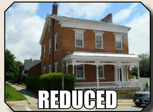
602 7th Street 3BR • 3BA

This is a beautifully appointed home with all the modern conveniences. There is an extra large lot for your family to enjoy! Listing #20162159, $164,000.