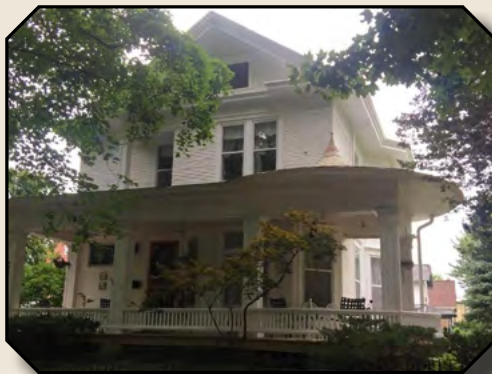
403 10th Street 5BR • 3BA

Beautiful victorian home on a quiet street with an amazing wrap-around porch. All the modern conveniences. Quite a charmer! Listing #20165372, $124,900.