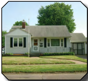
2634 Avenue G Listing #20165688; $94,500