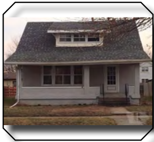
1712 Avenue E Listing #20164725; $92,000