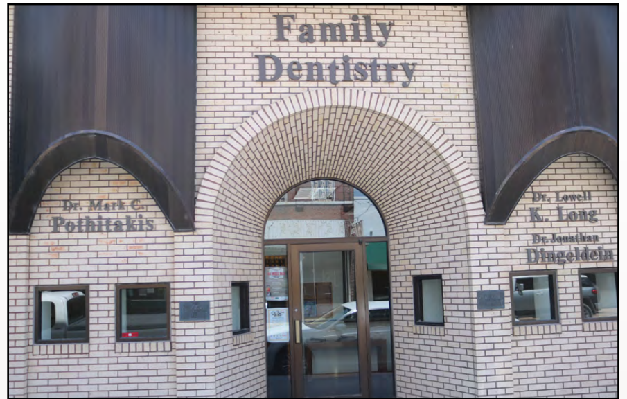
FORT MADISON FAMILY DENTISTRY EAST 726 Avenue G, Fort Madison, IA 52627 319-372-3614