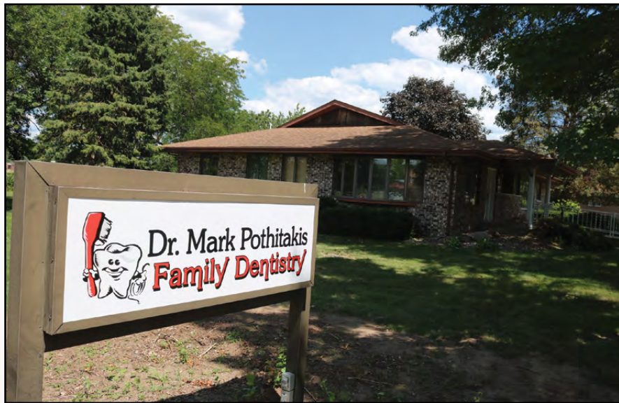
FORT MADISON FAMILY DENTISTRY WEST 4723 Avenue J, Fort Madison, IA 52627 319-372-4882

WE'RE NOW LOCATED IN 2 OFFICES TO SERVE YOU BETTER!