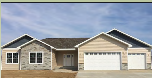
26 Green Oak Court, Fort Madison Iowa New Construction Built in 2017