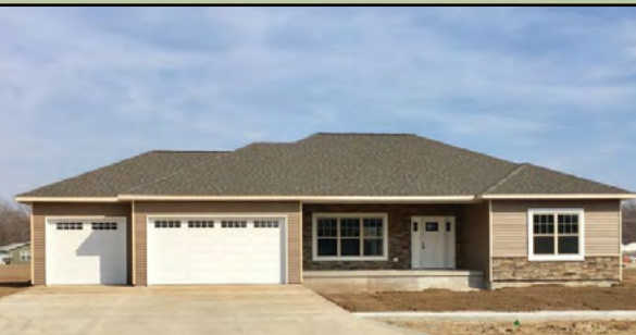
25 Green Oak Court, Fort Madison Iowa New Construction Built in 2017