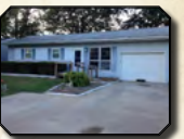
4613 Avenue L 3BR • 1.75BA • 1 car garage Listing #20163423