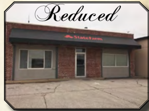
939 Avenue G Turn Key Office Space Listing #20165675