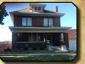
834 Avenue F 3BR • 1BA Listing #20164461