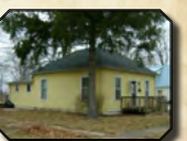
211 Main Street, Montrose 2BR • 1BA • 2 car garage Listing #2014279