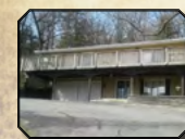
4911 Bluff Road 3BR • 1.75BA • 2 car garage Listing #20164861