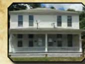
721-723 Avenue D 4BR • 3BA • 2 car garage Listing #20166346