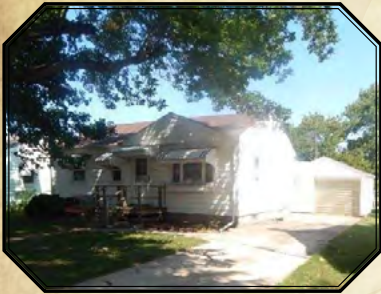
118 Avenue E • West Point 3BR • 1BA • 1 car garage Listing #20166662