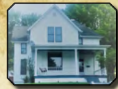
225 Avenue E 4BR • 2BA • 3 car garage Listing #20165899