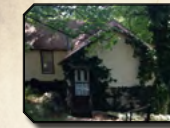
536 Avenue C 2BR • 1BA Listing #20166078