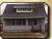
1712 Avenue E 4BR • 1.50BA Listing #20164725