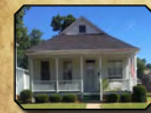
1031 Avenue G 3BR • 2BA • 2 car garage Listing #20166255