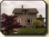
620 34th Street 2BR • 2BA • 3 car garage Listing #20165503