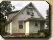
721 Maple Street, Donnellson 3BR • 2BA • 1 car garage Listing #20166590