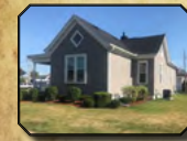
2002 Avenue G 3BR • 2BA • 1 car garage Listing #20166517