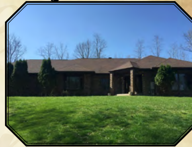
15 15th Street • Fort Madison 3BR • 4BA • 3 car garage Listing #20166815