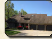
2160 Grand Venture Avenue 3BR • 2BA • 3 car garage Listing #20165295