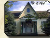
1212 Avenue E 4BR • 2BA • 1 car garage Listing #20166582