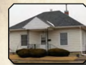
1315 Avenue E 3BR • 1BA • 1 car garage Listing #20164148