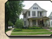
604 Avenue E 4BR • 2BA • 1 car garage Listing #20165688