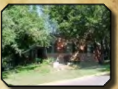
307 9th Street 2BR • 2BA Listing #20166492