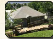
530 Avenue C 3BR • 2BA • 2 car garage Listing #20166051