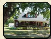
307 South 5th Street, Farmington 5BR • 2.50BA • 2 car garage Listing #20164117