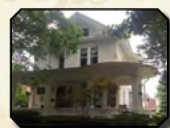
403 10th Street 5BR • 3BA Listing #20166615