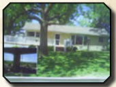
3569 Hwy 16, Weaver 2BR • 2BA • 2 car garage Listing #20165958