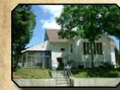
412 24th Street 2BR • 2BA • 2 car garage Listing #20166236