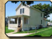
2709 Avenue M 2BR • 2BA • 2 car garage Listing #20166516