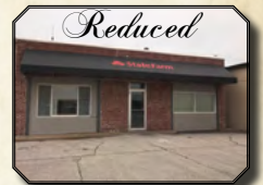
939 Avenue G Turn Key Office Space Listing #20165675