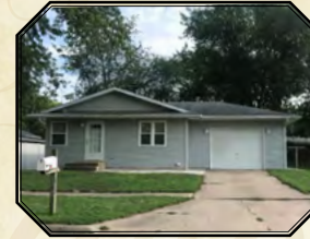
3032 Avenue E • Fort Madison 3BR • 1BA • 1 car garage Listing #20166815