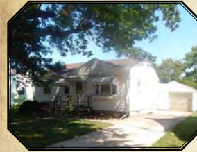
118 Avenue E • West Point 3BR • 1BA • 1 car garage Listing #20166662