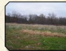
48th Street 50.82 acres • 2,213,719 sq. ft. Listing #20162779