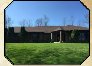
15 15th Street • Fort Madison 3BR • 4BA • 3 car garage Listing #20166815