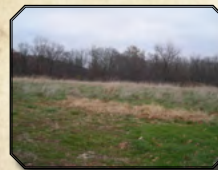
2188 Old Denmark Road E 14.65 acres • 638,514 sq. ft. Listing #20162574