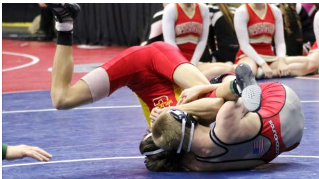
Penrith, CEFA 3176