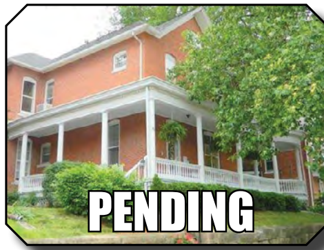
631 Avenue D 4BR • 2BA • 2 car garage

2 well-maintained homes for the price of 1! Owners gutted both homes & re-modeled. Live in the bigger home and rent the other out. Fantastic opportunity! Listing #20165268, $124,900.