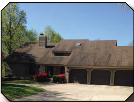
2160 Grand Venture Avenue 3BR • 4BA • 3 car garage

Motivated seller has reduced their asking price! Completely renovated home. This beautiful home won't be on the market long! Listing #20165503, $138,500.