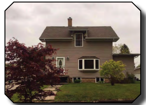
620 34th Street 2BR • 2BA • 3 car garage

Beautiful victorian home on a quiet street with an amazing wrap-around porch. All the modern conveniences. Quite a charmer! Listing #20165372, $124,900.