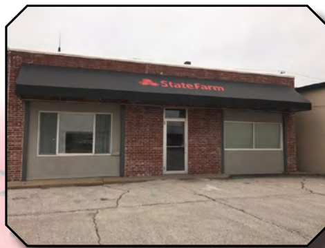
939 Avenue G Turn Key Office Space

Amazing home in a private, wooded 7.5 acre setting just minutes from Fort Madison. Approximately 6 acres are timber and ravine woods. Listing #20165295, $309,900.