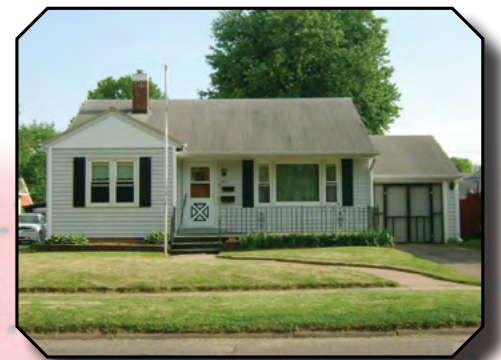
2634 Avenue G

Freshly finished office space in historic downtown Fort Madison with private offices, kitchen area, and phone system in place and ready to use! Listing #20165675, $79,500.