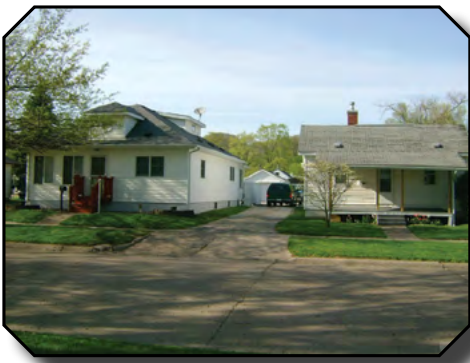
2323 & 2327 Avenue C 3BR • 3BA • 1 car garage

2 well-maintained homes for the price of 1! Owners gutted both homes & re-modeled. Live in the bigger home and rent the other out. Fantastic opportunity! Listing #20165268, $124,900.