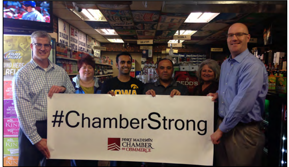
Quicker Liquor is #ChamberStrong