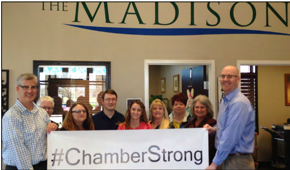
The Madison is #ChamberStrong