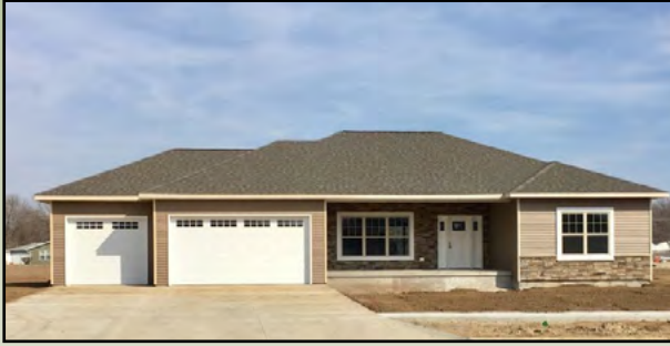
25 Green Oak Court, Fort Madison Iowa New Construction Built in 2017