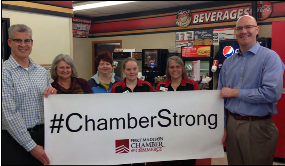
Casey's West is #ChamberStrong