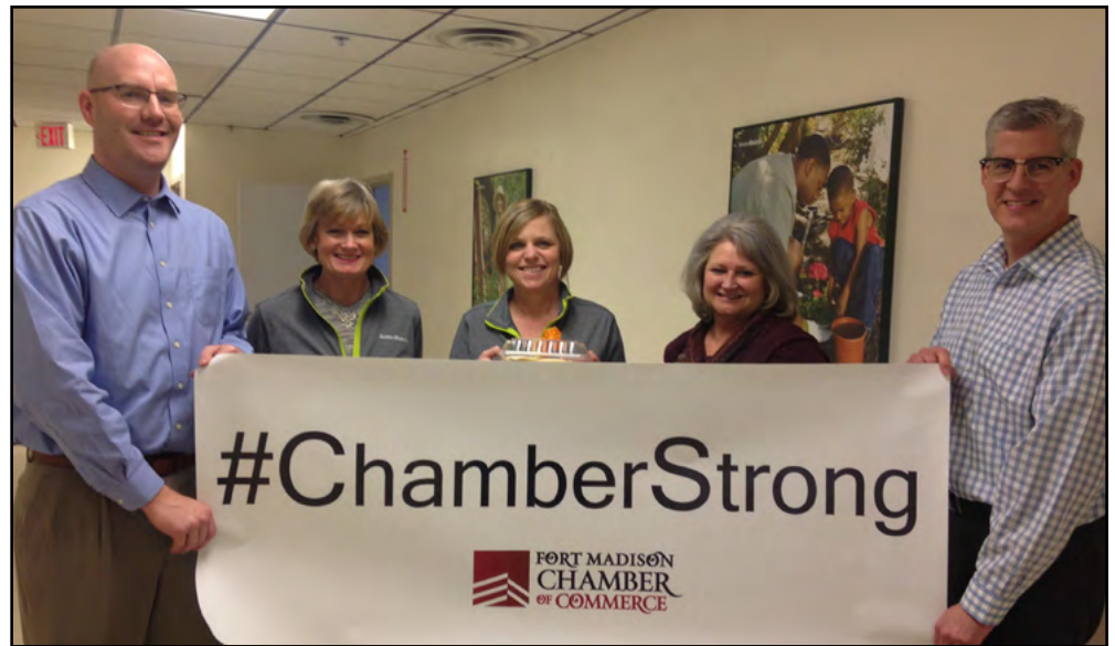
Scotts is #ChamberStrong