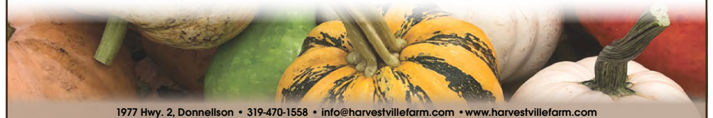
1977 Hwy. 2, Donnellson • 319-470-1558 • info@harvestvillefarm.com • www.harvestvillefarm.com

September/October Hours: Mon-Sat 9am-7pm; Sun 11am-7pm The Pitchfork Cafe Hours: Mon-Fri 11am - 3pm; Sat & Sun 11am - 5pm