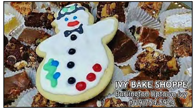
IVY BAKE SHOPPE Burlington Uptown Ivy (319)754.5924

Remember the original Ivy for your holiday desserts, sweet trays, catering, & gift certificates. Order yours by Tuesday, December 21st. Call us at Burlington Uptown Ivy (319)754.5924 or visit us at 514 Jefferson Street, downtown Burlington. Visit us online at www.ivybakeshoppe.com .