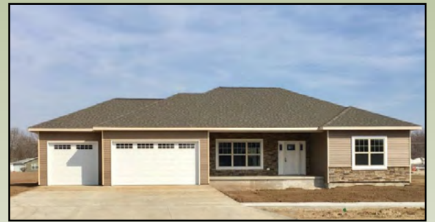
25 Green Oak Court, Fort Madison Iowa New Construction Built in 2017