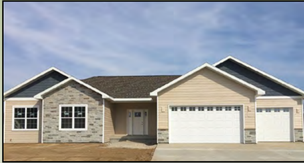
26 Green Oak Court, Fort Madison Iowa New Construction Built in 2017