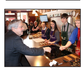
See more photos on our Instagram and Pinterest sites @pencitycurrent

"I think it was a great honor, not only for the test