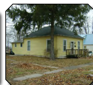
211 Main St., Montrose Listing #20164279; $38,500