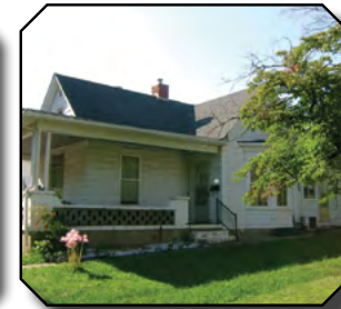
315 Avenue E Listing #20162543; $53,000