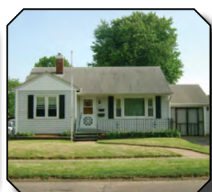
2634 Avenue G Listing #20165688; $94,500