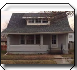
1712 Avenue E Listing #20164725; $92,000