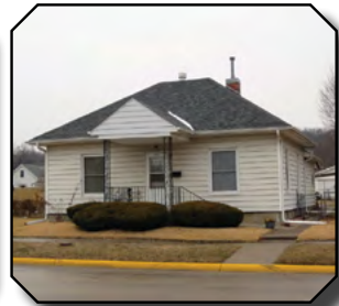
1315 Avenue E Listing #20164148; $72,500