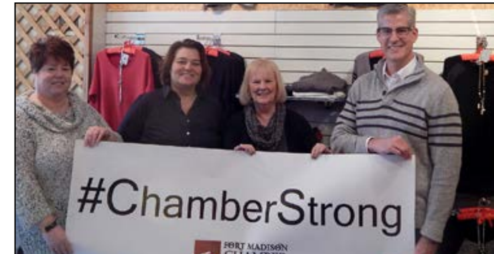
The Colony Shop and Bridal Loft is #ChamberStrong