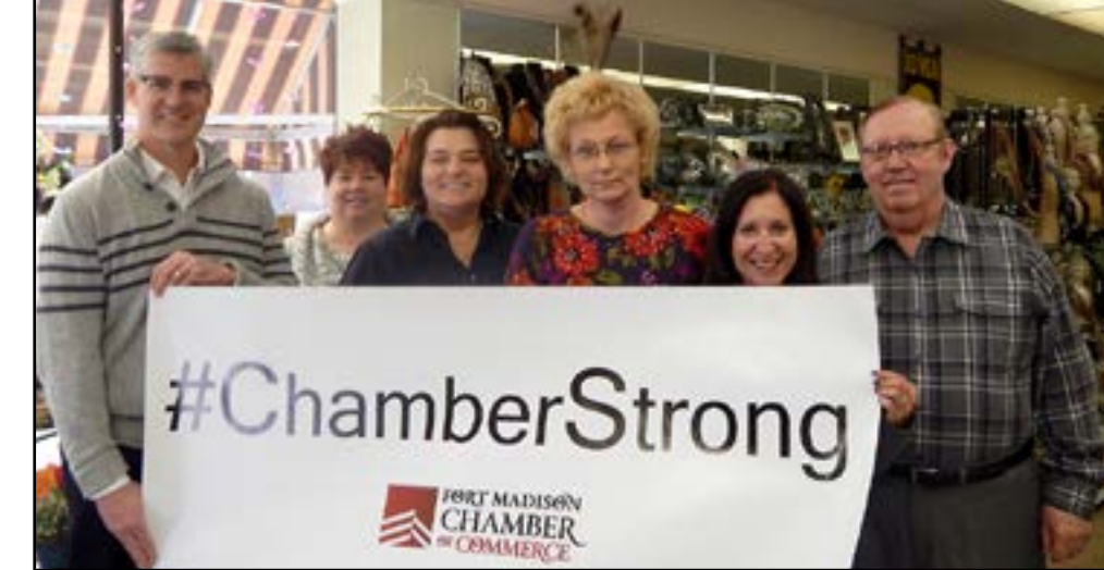
Under the Sun is #ChamberStrong