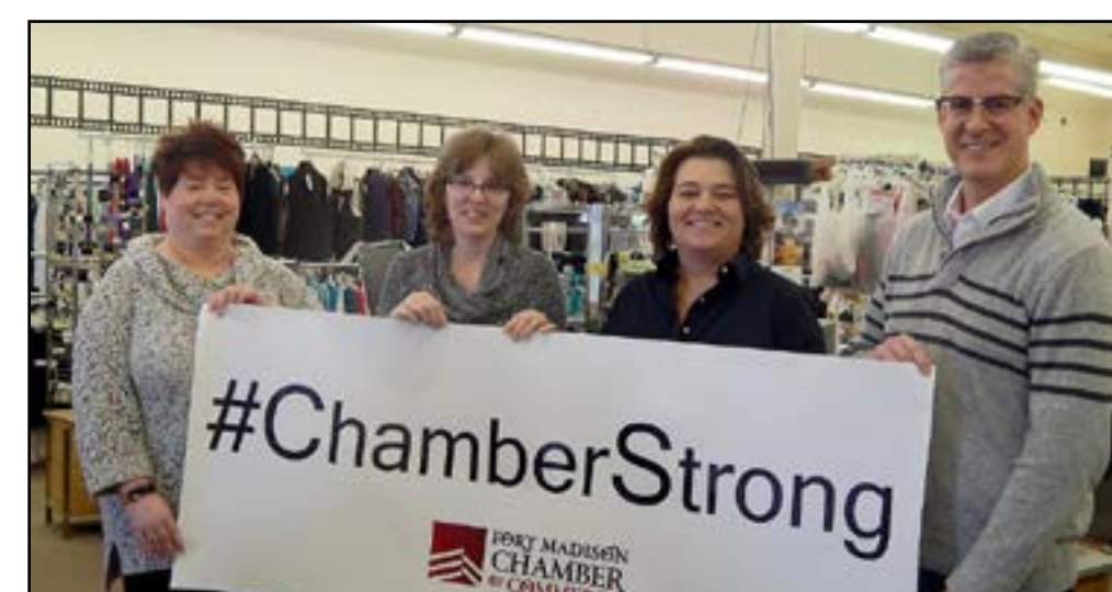
Stage 2 is #ChamberStrong