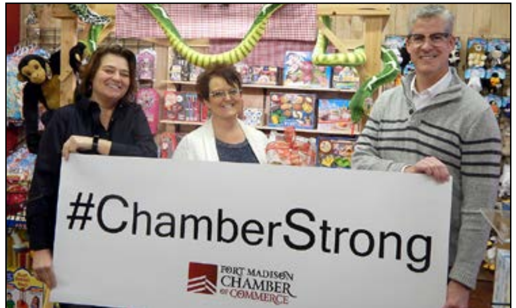
Dollhouse Dreams is #ChamberStrong

Writers, photographers have new venue to publish personal creations