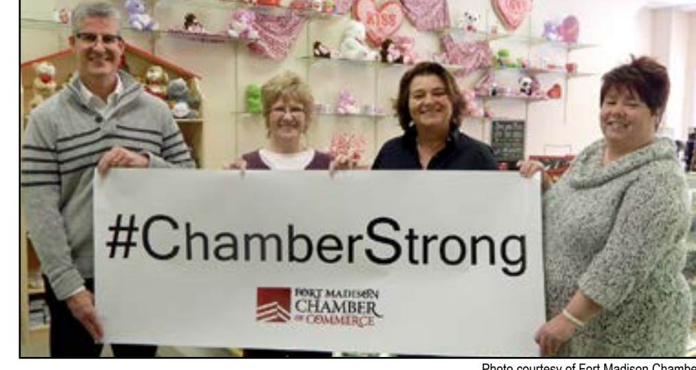
The Avenue is #ChamberStrong