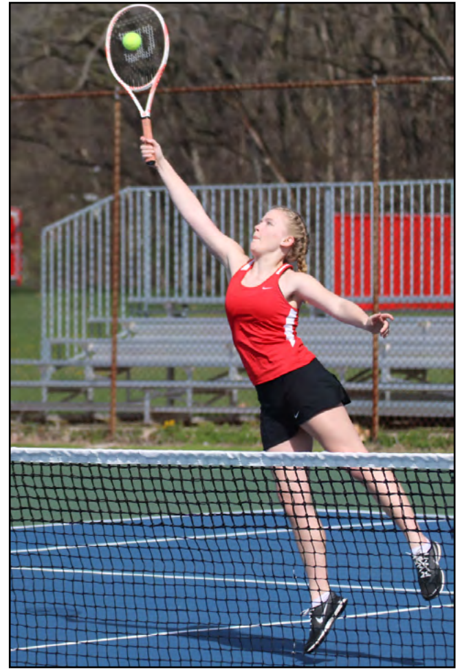
At the net

The Lady Hounds travel to Keokuk for a 4:30 dual meet on Monday.