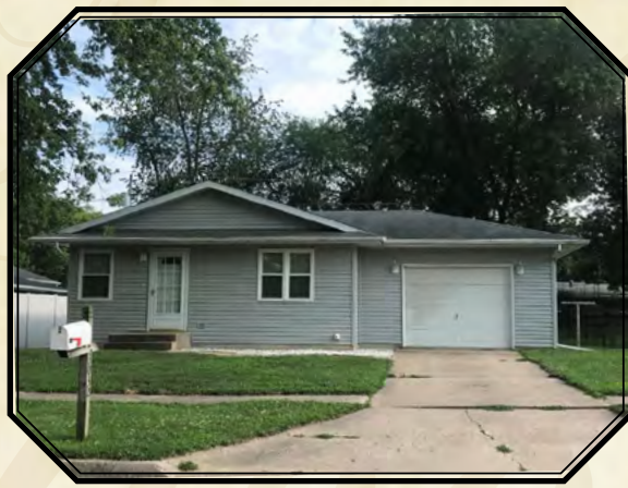
3032 Avenue E • Fort Madison 3BR • 1BA • 1 car garage Listing #20166815