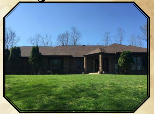
15 15th Street • Fort Madison 3BR • 4BA • 3 car garage Listing #20166815