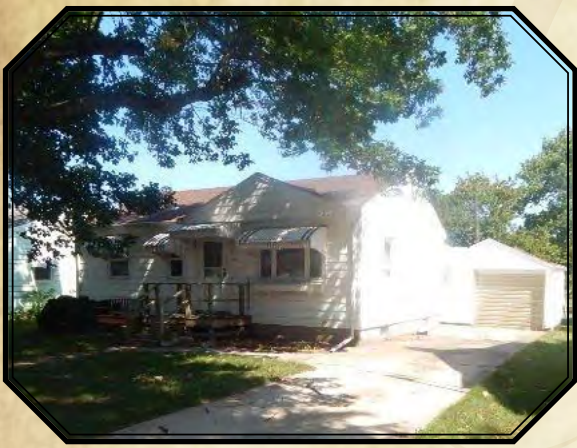
118 Avenue E • West Point 3BR • 1BA • 1 car garage Listing #20166662