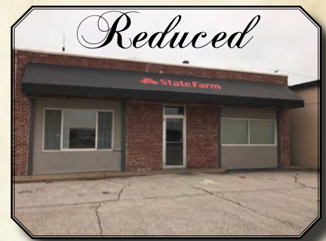
939 Avenue G Turn Key Office Space Listing #20165675