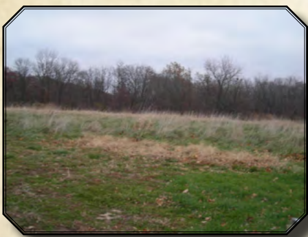
2188 Old Denmark Road E 14.65 acres • 638,514 sq. ft. Listing #20162574