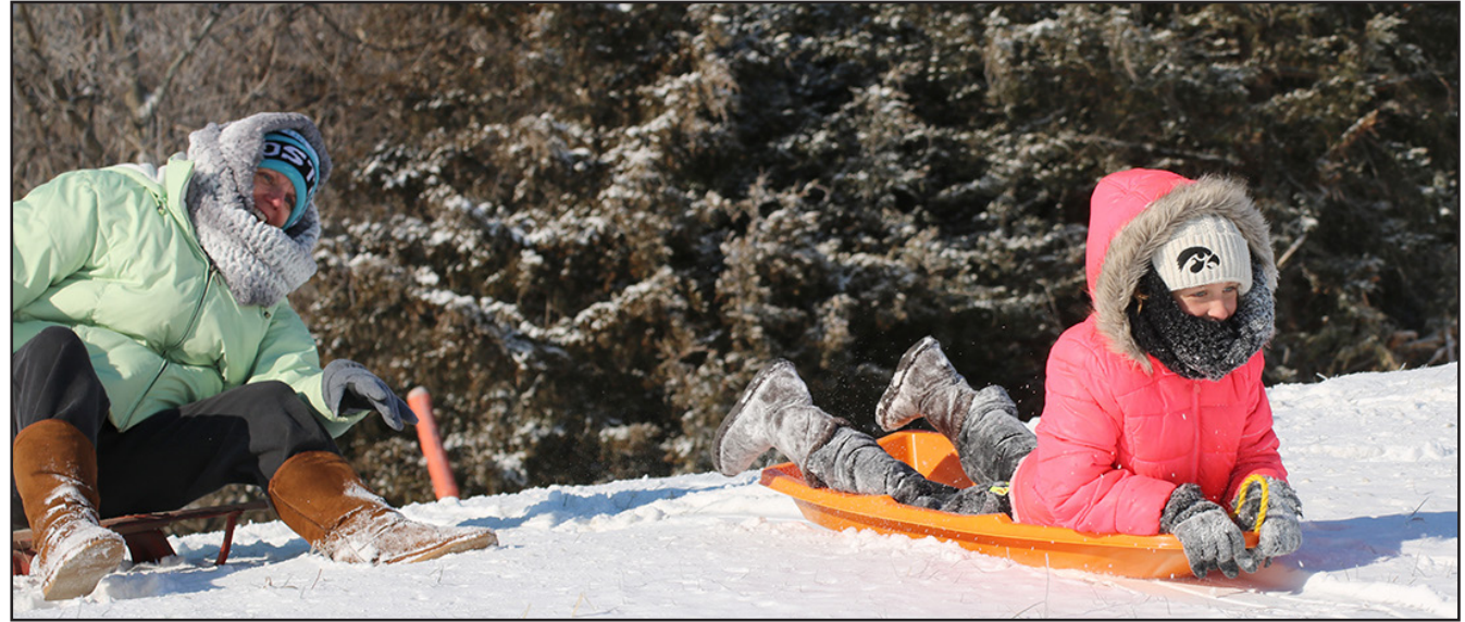
"Wait for me..."

Pen City Current P.O. Box 366 Fort Madison, IA