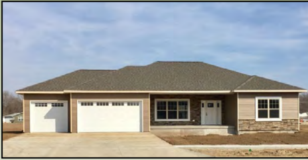
25 Green Oak Court, Fort Madison Iowa New Construction Built in 2017