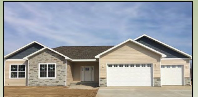
26 Green Oak Court, Fort Madison Iowa New Construction Built in 2017