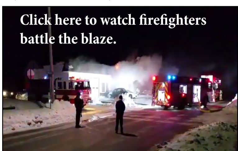
Click here to watch firefighters battle the blaze.