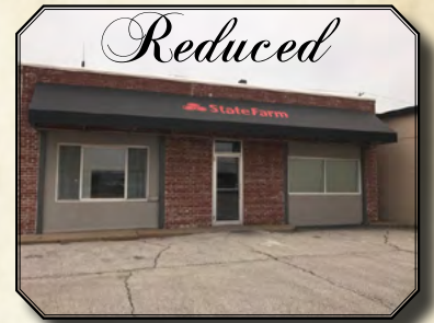
939 Avenue G Turn Key Office Space Listing #20165675