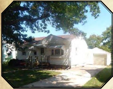
118 Avenue E • West Point 3BR • 1BA • 1 car garage Listing #20166662