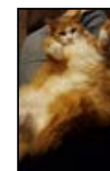
Mr. Francois Bartholomew McMeow