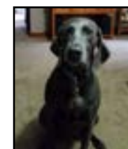
Princess Maggie Sapphire

Vote for your favorite at www.pencycurrent.com/pets or click this ad. The pet with the most votes will be recognized in an upcoming issue of Pen City Current and on our website. We're also collecting donations for P.A.W. Animal Shelter. 100% of donations will be given to P.A.W. at the end of the promotion. Voting is open through Tuesday, February 14th.