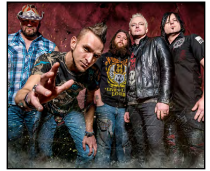
SAVING ABEL - Thursday night