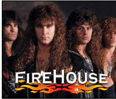
FIREHOUSE - Friday night