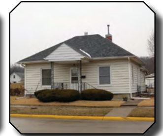
1315 Avenue E Listing #20164148; $72,500