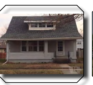
1712 Avenue E Listing #20164725; $92,000