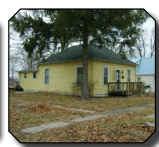
211 Main St., Montrose Listing #20164279; $38,500