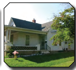
315 Avenue E Listing #20162543; $53,000