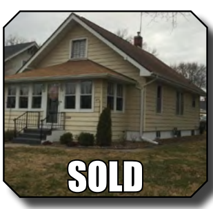
1821 Avenue E Listing #20164622; $88,000