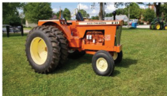
1940 D45 Allis Chalmers

DAILY ACTIVITIES Homemade Ice Cream Book Sale Antiques/Primitives Flea Market/Crafts Horse Drawn Wagon Rides Kids' Train Rides Kettle Corn