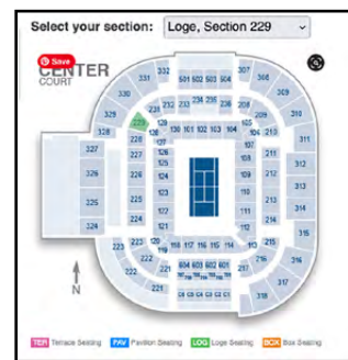
Section 229 (Green) Front Row

2 premium tickets to Cincinnati's Western & Southern Open ATP/WTA Tennis Tournament for opening weekend. Features 3 sessions including all qualifying rounds on Saturday & Sunday, August 14 & 15, and first round action on Sunday, August 15. Front row, section 229. $450 for all 6 tickets and hours and hours of tennis fun! Text Lee at 319.371.4125 or email finnaginn01@gmail.com .