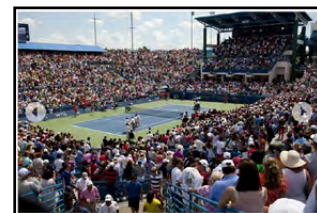
View from our section - FRONT ROW!!!

TENNIS FANS, WE'VE GOT SOMETHING SPECIAL FOR YOU!!!