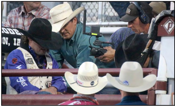
A saddle bronc rider gets up close on a camera feed before his mount jumped out of the chute in Thursday Tri State Rodeo action.