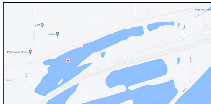
day night. Firefighters were able to pull the man to safety after close to an hour of being in the water.

The red arrow shows the approximate location of a pickup truck that partially submerged in about three feet of icy water Wednesday night.