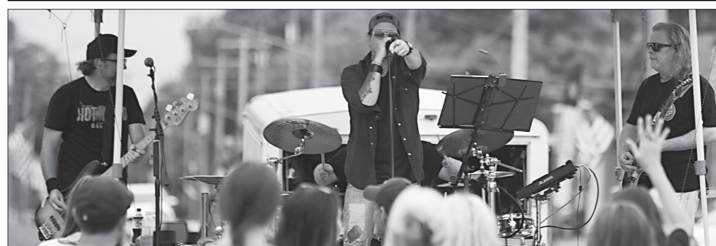
Throughout the evening and night of Friday, June 7, Frontenac Mining Days will host two bands for live performances on the east and west stages, Jukebox Hero Band and J3 Band.