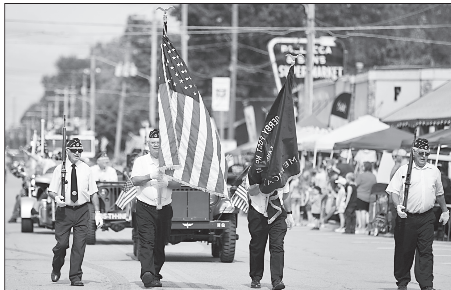
As is tradition, members of the John F. Derby American Legion Post 43 lead the parade during last year's Frontenac Mining Days as this year's parade is scheduled to take place at 9 a.m. Saturday, June 8.