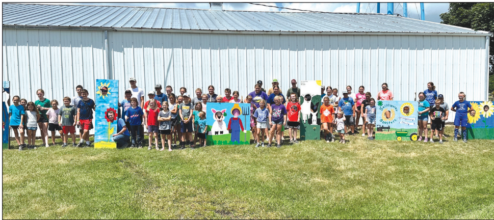
The Fair Social group poses for a picture.