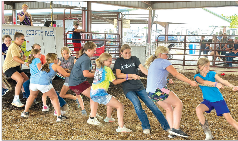
Kountry Kids members compete in tug-o-war.

The following pages feature articles and photos from Montgomery County 4-H members. Congratulations to all members for their dedication, hard work and commitment they show.