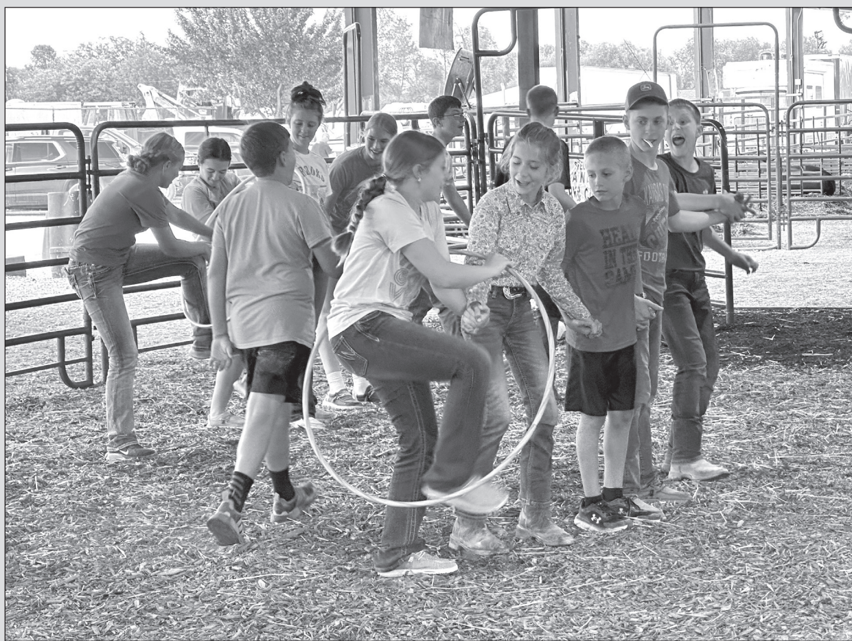
Members of the Big Spring Busy Beavers participate in the hula hoop.