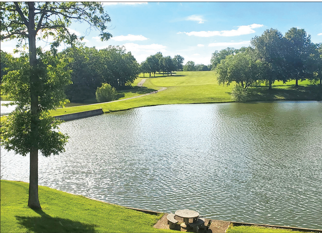
Country Lake Golf Course is planning multiple changes to the property. Submitted photo.