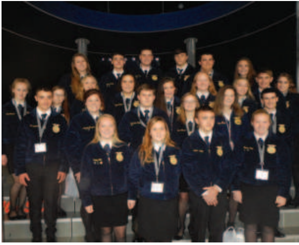
National Convention was a blast! From walking FFA Way, to touring an exotic cat rescue, and a tour of Fastenal.