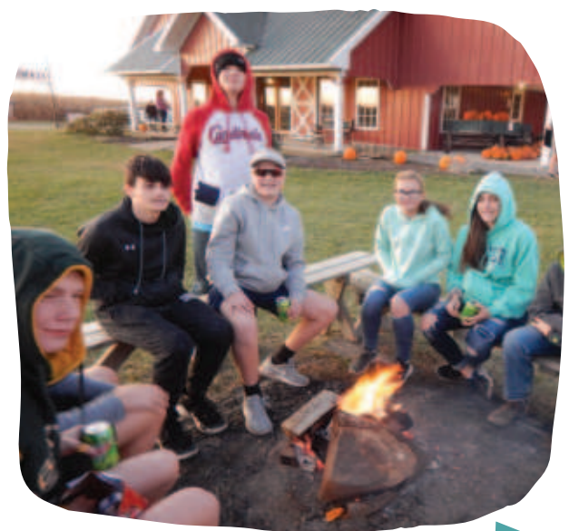
Future FFA members enjoying a campfire at Shyrocks Corn Maze during our 8th grade recruitment trip