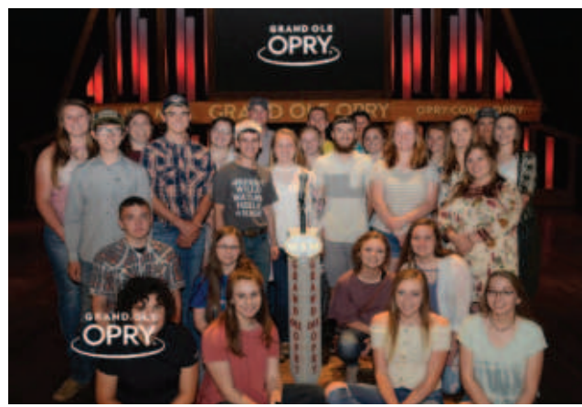
This year's spring rewards trip to Music City made for a full three days. We spent a night at the Opry, had chapter dinner at the George Jones Smokehouse, and visited historic downtown tourist stops.