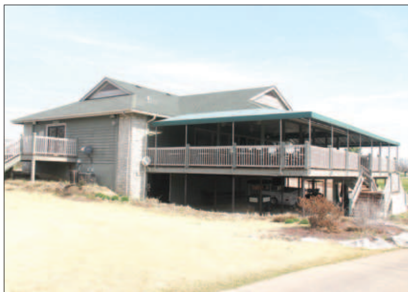
Golf Club at Incline Village.