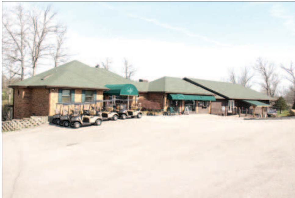
Country Lake Golf Club.

Schatz also mentioned that there are optional skins game, closest to the pin contests, and discounted drink/food