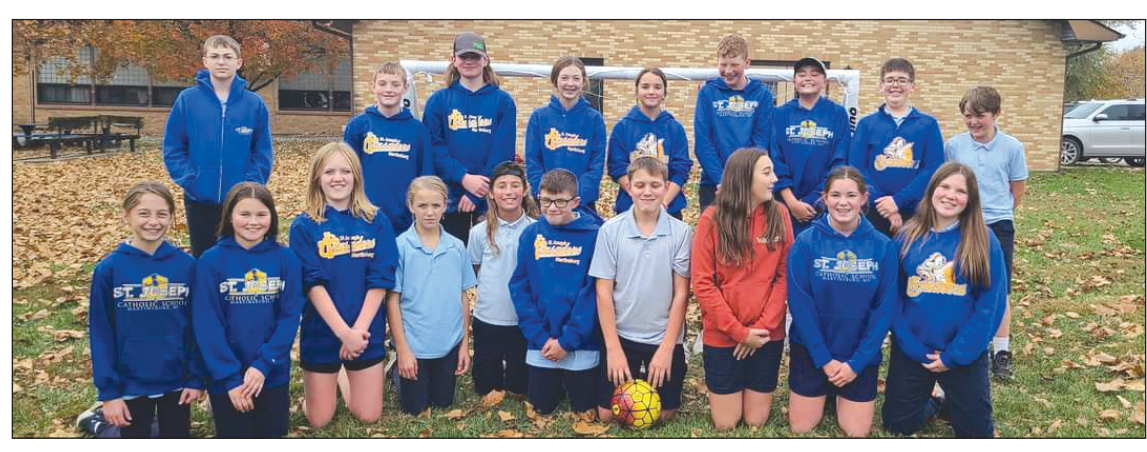
Students in grades 5-8 enjoyed our new soccer goals this year.