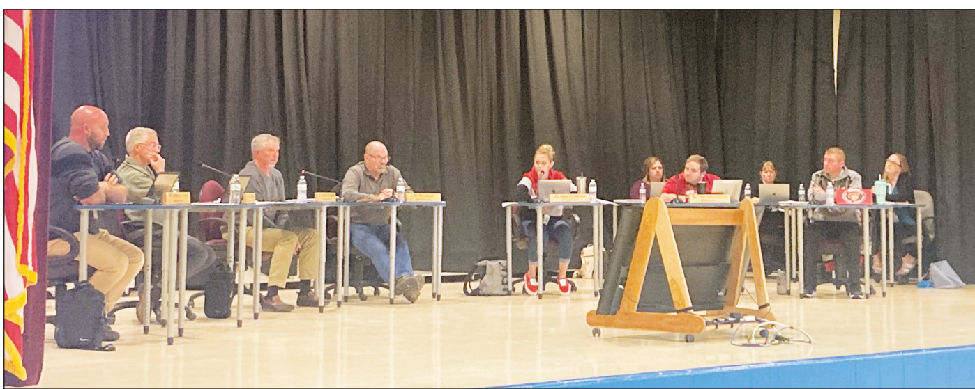
Sparta Area School District Board of Education members discuss budget cuts.

teacher at Cataract, said the district has hired non-classroom staff to address poor test scores among students, but that strategy doesn't seem to be having an impact on student performance. She said the district needs to invest in teacher training and professional development.