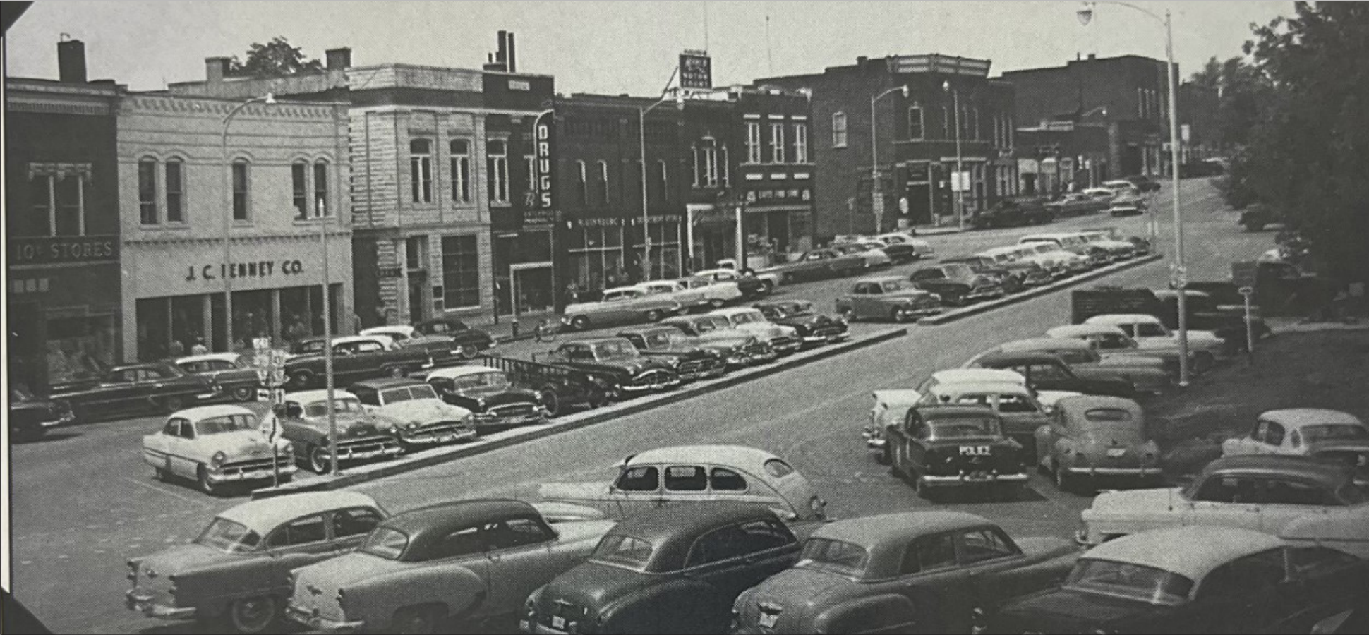
The southside of the Lewisburg Square around 1951.

NOTICE TO FURNISHERS OF LABOR AND MATERIALS TO: Rogers Group, Inc. PROJECT NO.: 591065-F8-002 CONTRACT NO.: CNV329 COUNTY: Marshall