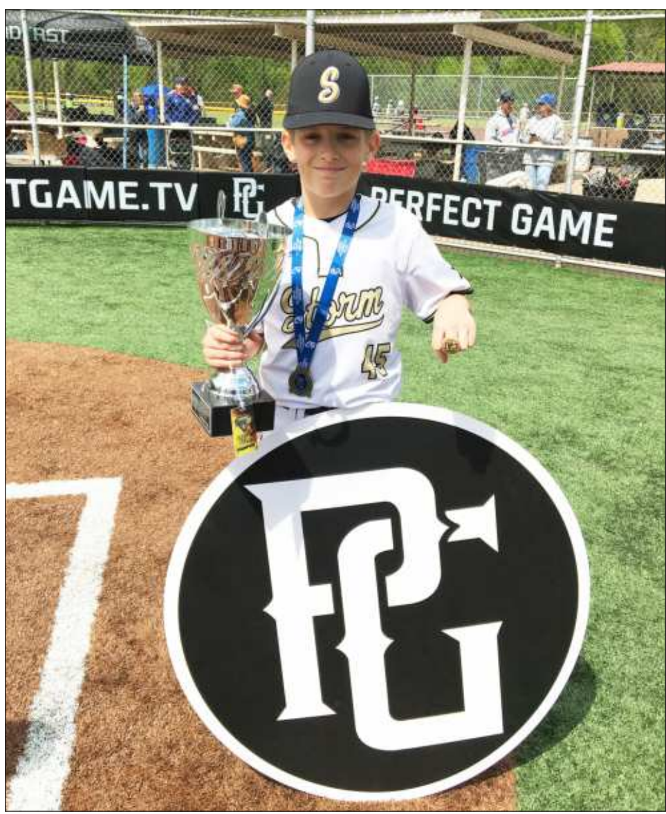
On Sunday, he hit a grand slam in the Perfect Game Championship Tournament and after his team won their championship game, traveled to Franklin to play in two basketball games, where he hit a buzzer-beater three-pointer to win the championship with the Tennessee Marathon.