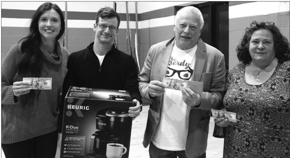
Congratulations to these lucky grand prize winners! One hundred dollar bills, $100 gift card, and a Keurig Coffee Maker were donated by The Air Guys, Brooks Grocery, Clint’s Air Care, Little Rocket Daycare, Rocket Car Wash, the Town of Chapel Hill and Truett Construction. Thank you to all!!