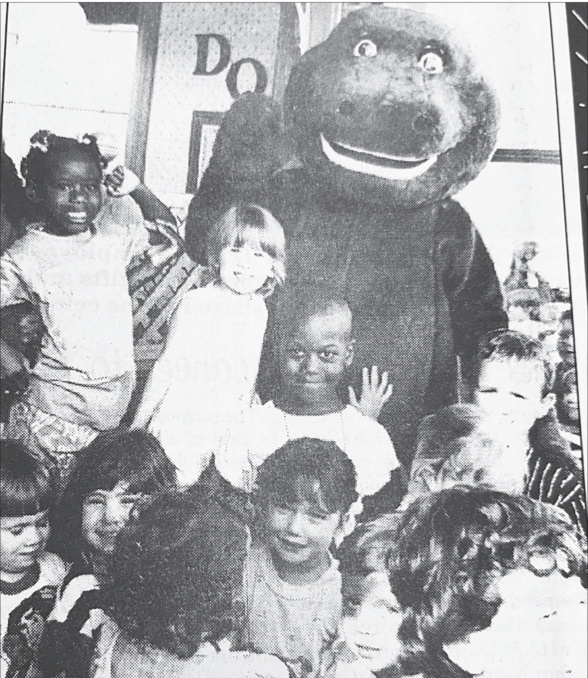
Parents with their children lined up around Dairy Queen to see the great purple dinosaur, Barney. (from The Marshall Gazette, June 1, 1993.)