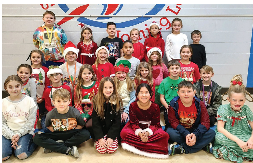
2nd Nine Weeks Awards 3rd Grade