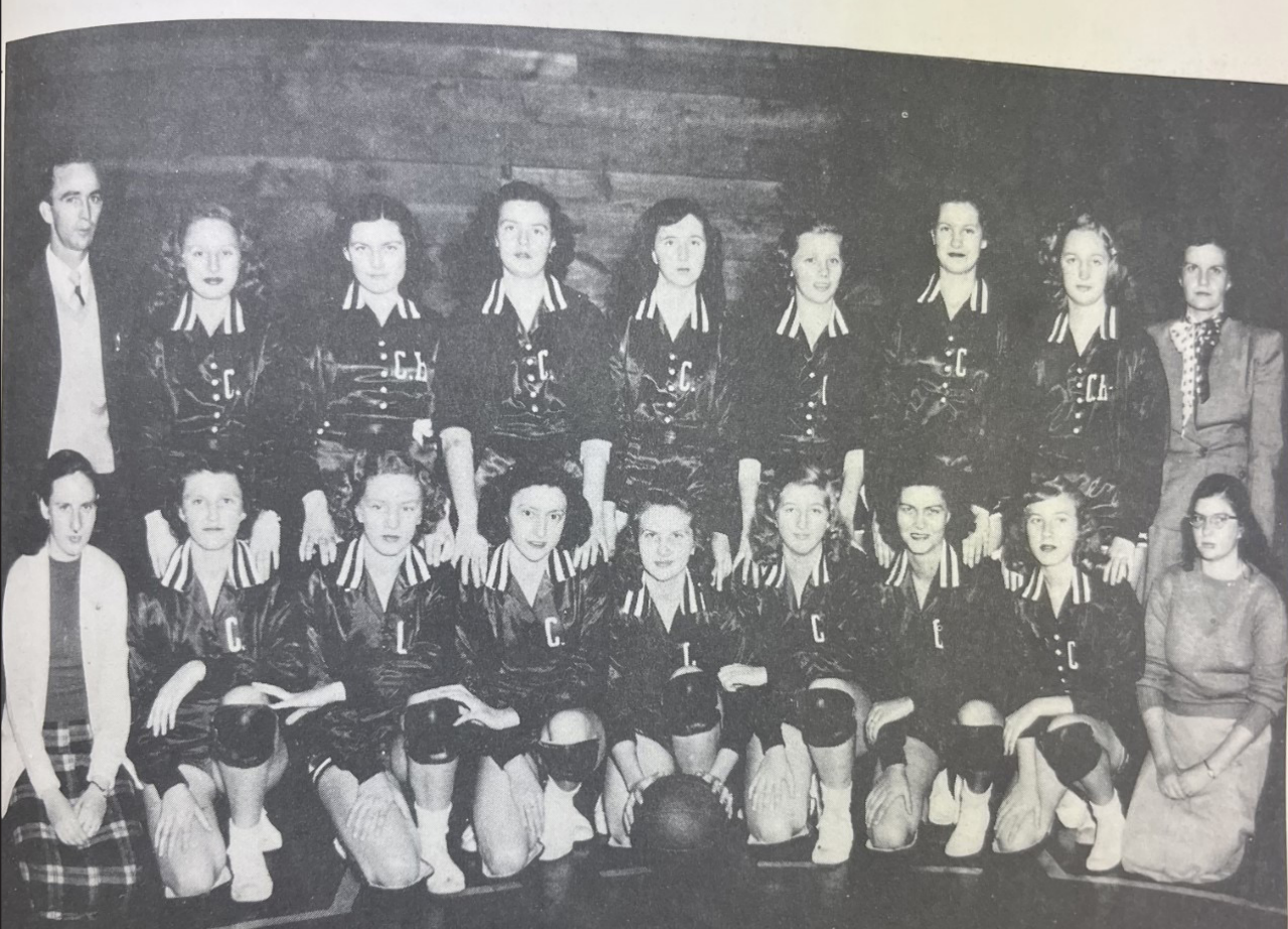
CHS 1948-49 Girls Basketball team