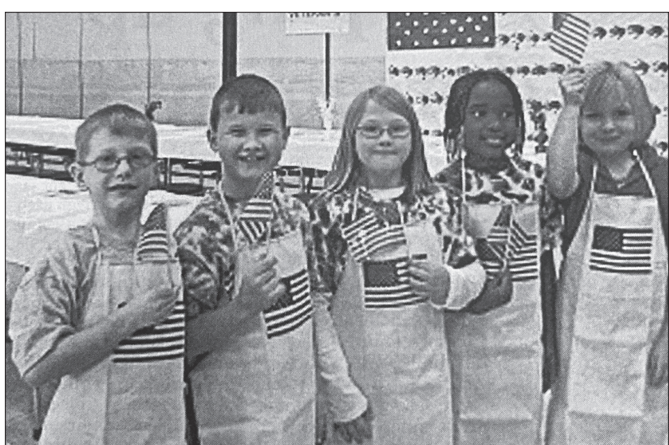
Students, faculty, and staff at Marshall Elementary School honored veterans with a breakfast. The veterans who attended were greeted, served and entertained by the students. These students hold flags displaying their appreciation to the veterans. (from The Marshall County Tribune, Nov. 26, 2008.)

This birth announcement was published in The Lewisburg Tribune, Sept. 27, 2001.