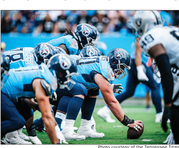
After climbing back to .500, the Titans are hoping to

ie will be out. NFL.com reported Burks has turf toe, but wouldn't need surgery. OLB Bud Dupree re-