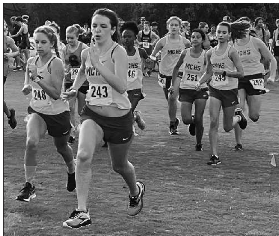
The Tigerettes take off at the start of the Voyles Classic.