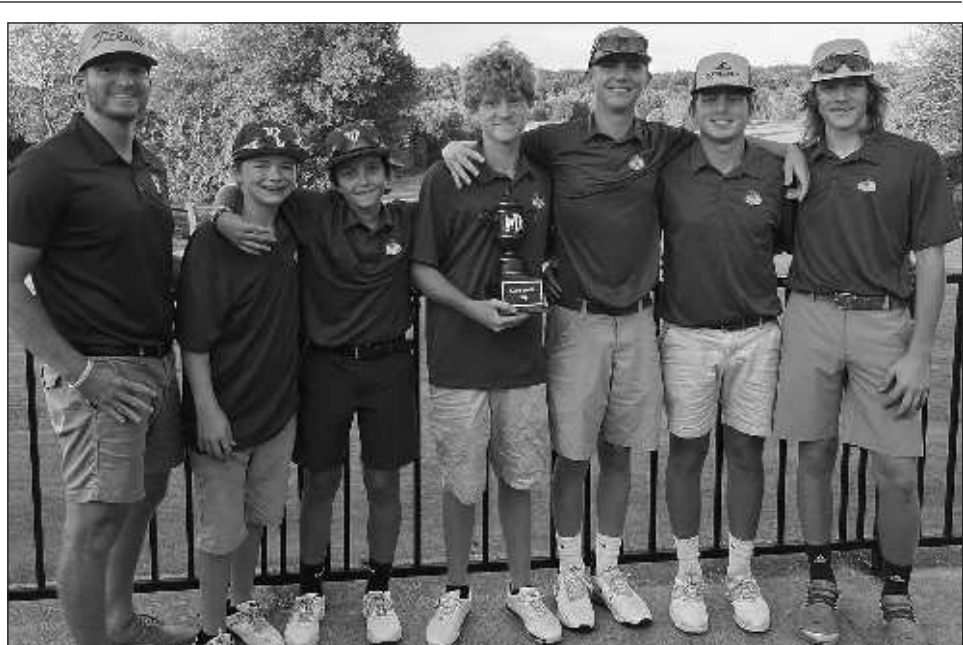
The Forrest Rockets posted a combined 542 three-day total for the team win in the Wells Cup.