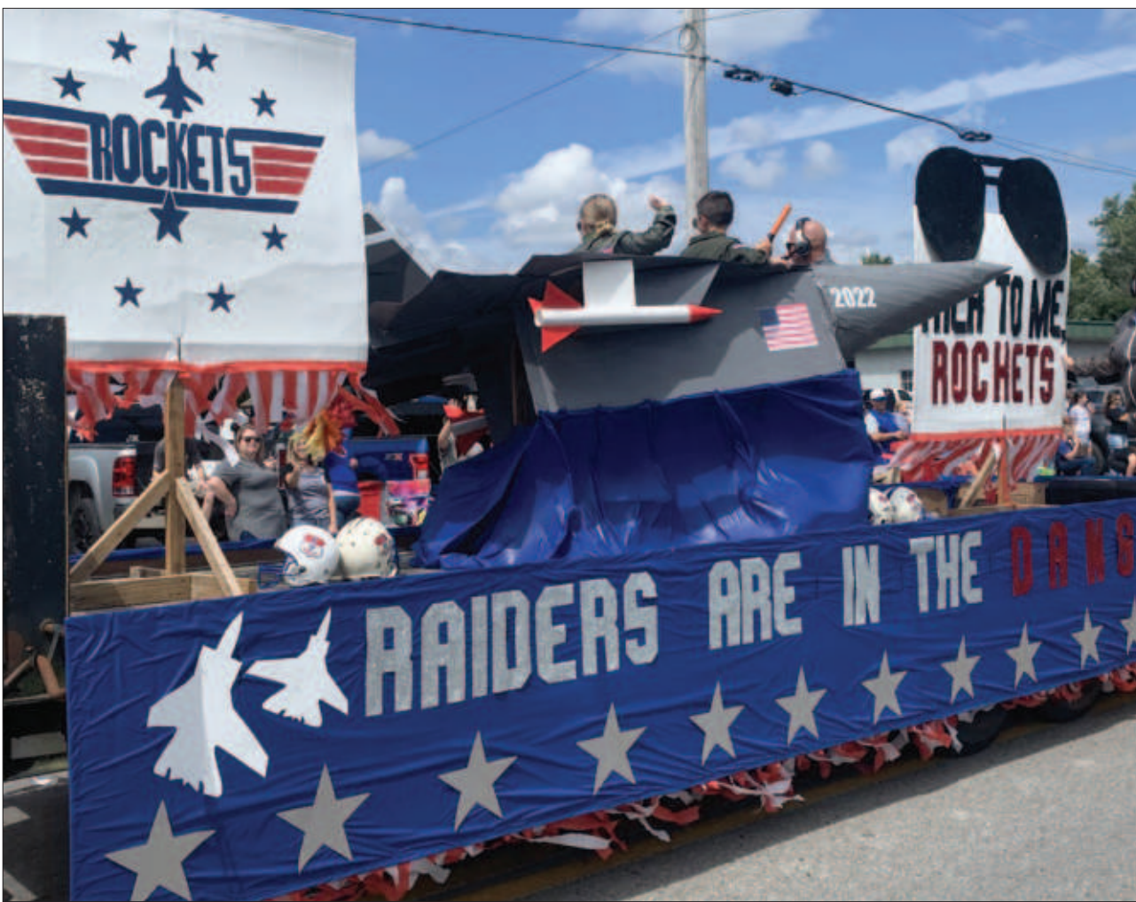
Last Friday all of the Chapel Hill schools displayed their Rocket pride during the annual homecoming parade. Exceptional floats from each grade delighted the crowds gathered to celebrate the event. Despite falling short on the field Friday night against Moore Co., Forrest proved that the spirit of Chapel Hill is undefeated. For more photos from the parade, turn to Page A8 of today's Marshall County Tribune.