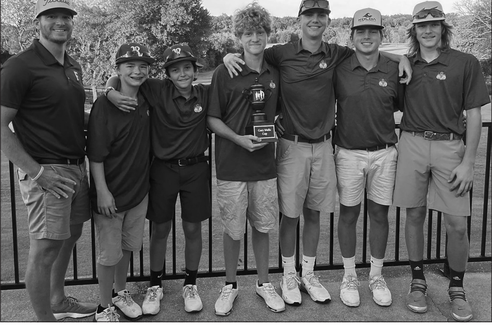
The Forrest Rockets posted a combined 542 three-day total for the team win in the Wells Cup.