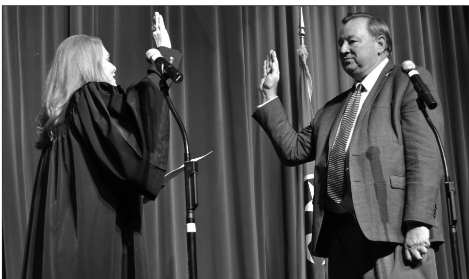
County Mayor Mike Keny