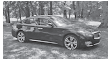
2017 Infiniti Q7 • 77,229 Miles