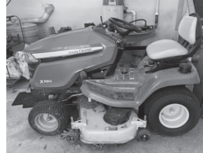
John Deere/only 78 hours

DIRECTIONS: From Lewisburg, take 431 South through Belfast into Petersburg, turn right on Boonshill Petersburg Rd and the property will be on the left, less than 9 miles. From Fayetteville, take Hwy 64 West to Boonshill Petersburg Rd, (Hwy 244); turn right and watch for the signs (about 1.5 miles)