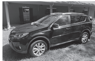
2014 Toyota Rav 4 • 73,812 Miles