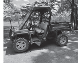
Only 180 miles